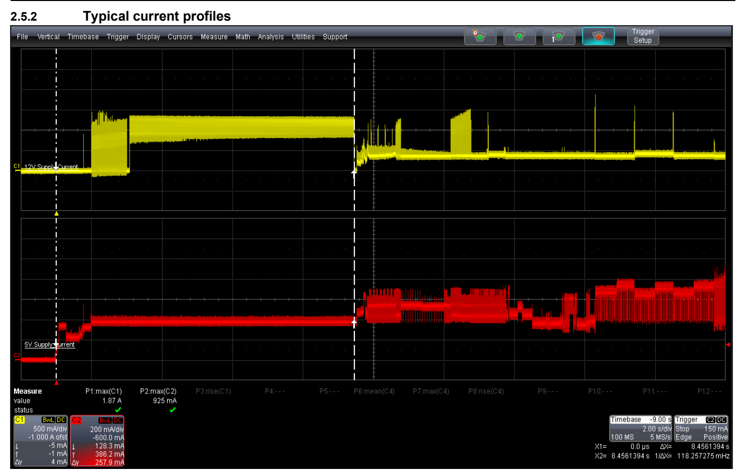
Figure 1. Typical 5V and 12V startup and operation current profiles